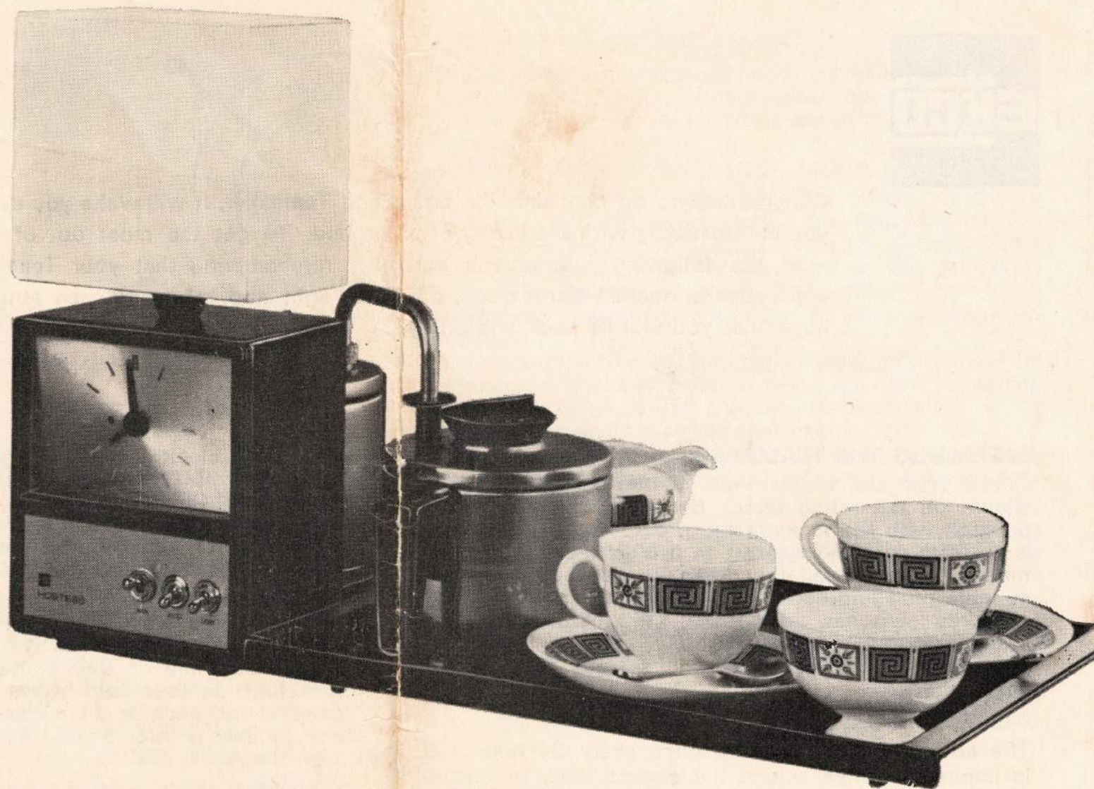
EKCO 'Hostess' Teamaker Models TE34/TT and TE34